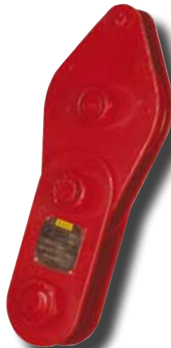
Guy Line Block