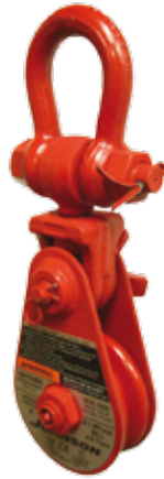
Single Sheave with Shackle