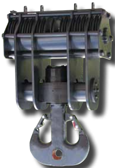
500 tonnes WLL Crane Block Duplex Hook