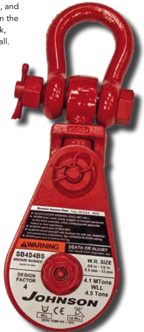
4 tonnes Snatch Block with Shackle

All hand nuts and shackles are fitted with "R" pins as a secondary securement device, for example where inspection is limited or infrequent due to location or other factors.