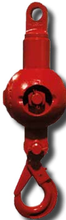
Gunnebo BK Safety Hook