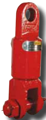
Eye and jaw