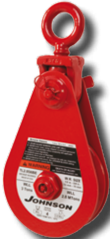
Tong Line Block

Gunnebo Johnson has been producing oilfield equipment for over five decades. Because of our expertise in sheaves and blocks, Gunnebo Johnson has become a respected manufacturer for the Petroleum industry. We know the needs and we have the know how to fulfil them with quality lifting devices. High capacity, custom engineered oilfield blocks available upon request.