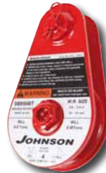
Tail Board Block