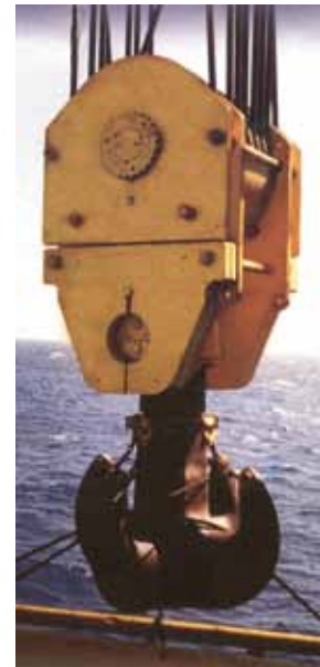
600 tonnes WLL Offshore Service Block Quadruplex Hook