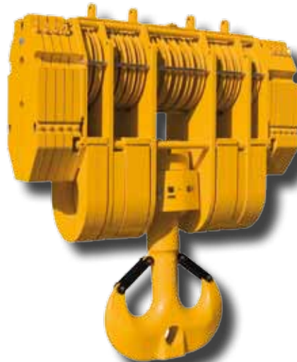
700 tonnes WLL Flexi-Weight™ Block Duplex Hook Removable Weights