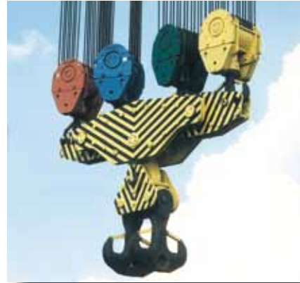
Mega Lift 3000 tonnes WLL Crane Ship Lifting System