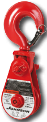
Single Sheave with Hook